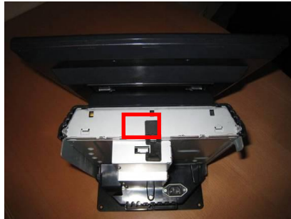
Customer display connector